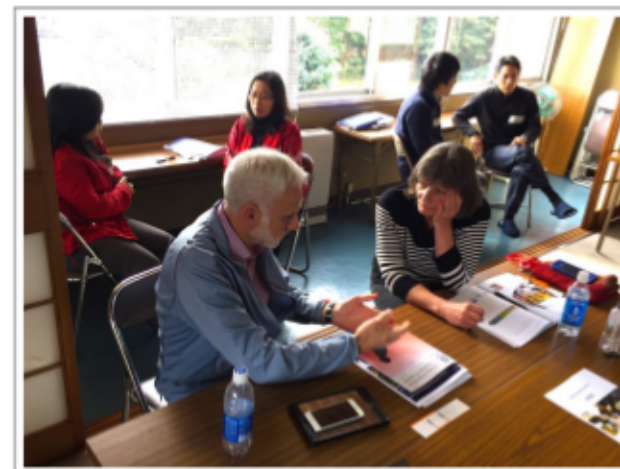
Participants at the Advanced Ignatian Teacher Program (AITP) share experiences and insights.