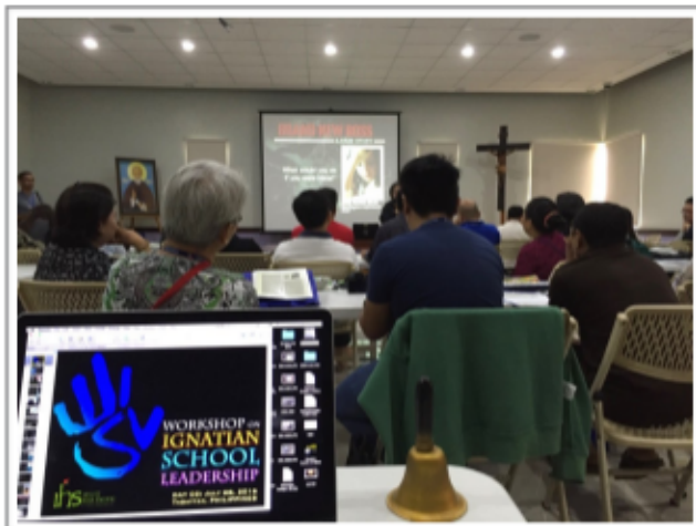
Administrators analyze a case at the Workshop on Ignatian School Leadership (WISL).